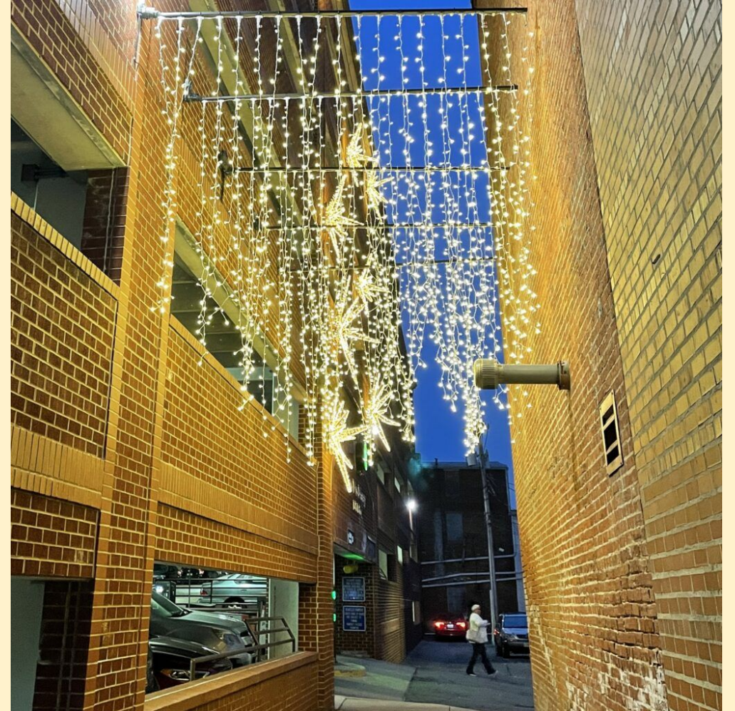
Alleyway lighting from Downtown Frederick Partnership