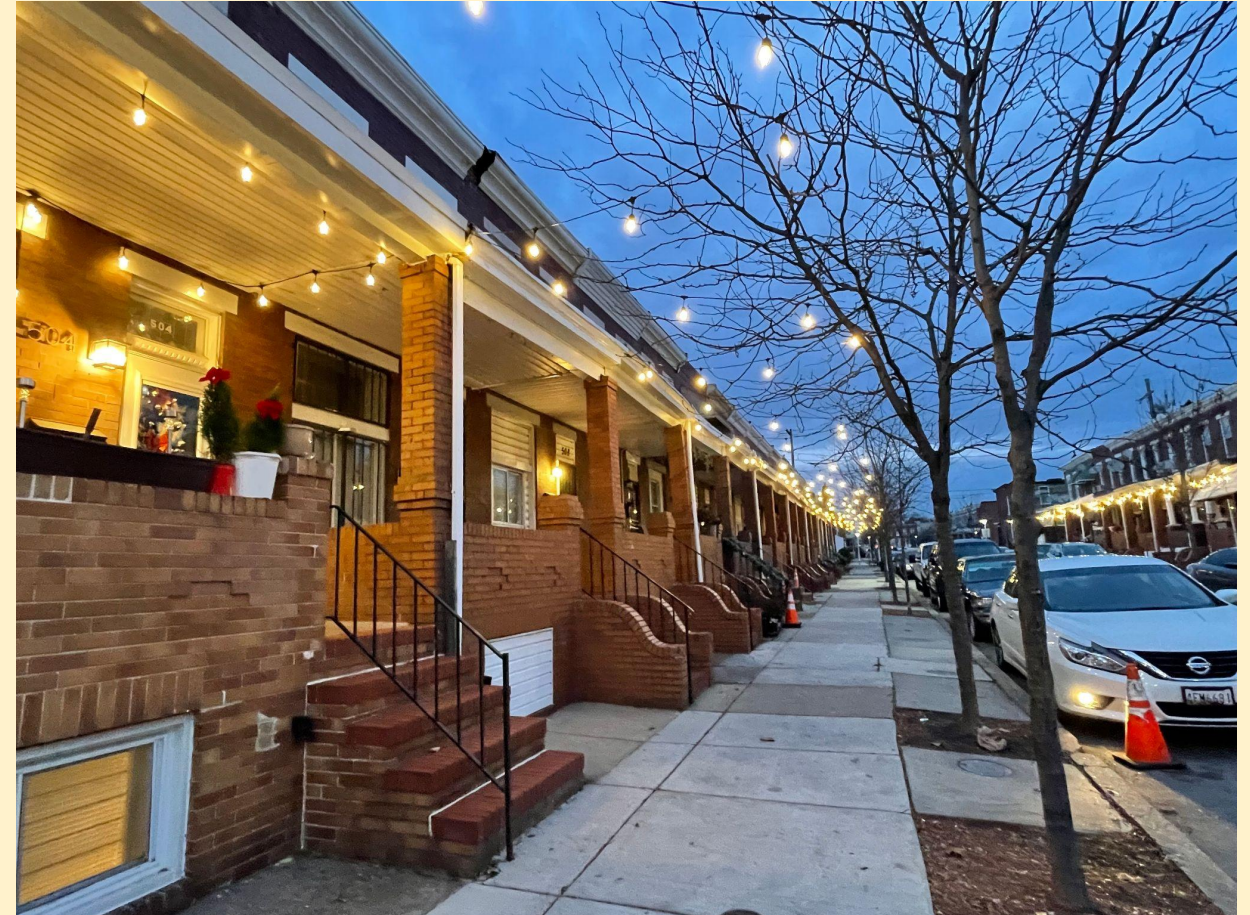
String lights on 500 Block of N. Robinson Street