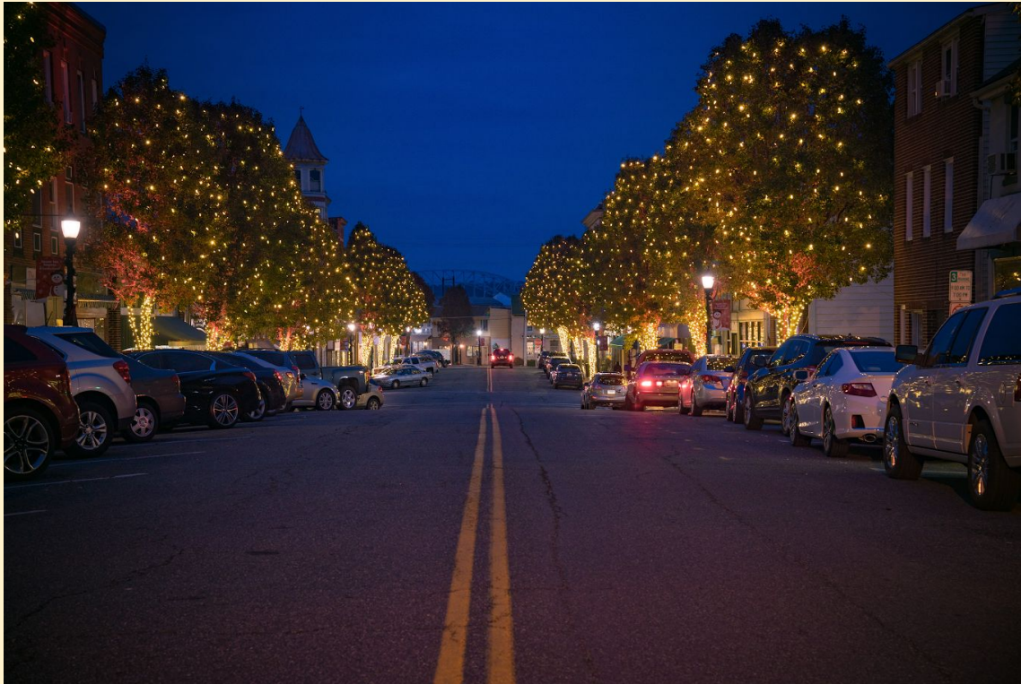
Havre de Grace's lighted treescape