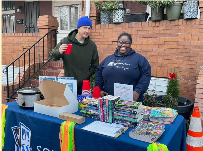
“Get Lit” block party on 500 Block of N. Robinson Street